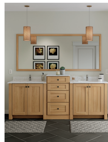
Front Cover: Reading Maple Rye shown with 5-Piece Drawer Front

For more images and details, see our catalog or visit woodmarkcabinetry.com/collections/vanity .