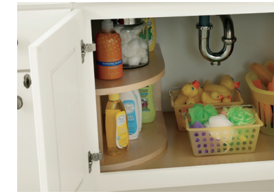
Sink Base Multi-Storage Shelf