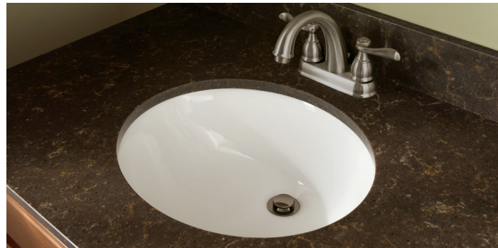
Oval White Sink with 4" Faucet