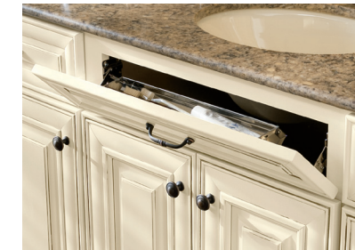
Tilt Out Drawer