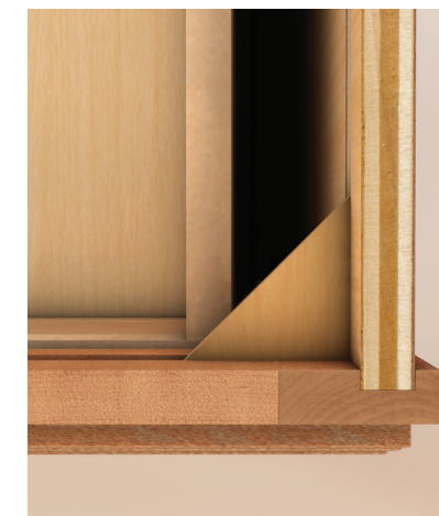
All Plywood Construction

All of our cabinets feature quality construction details and are built to last. Consider adding some of these options to achieve a higher-end look and added value.