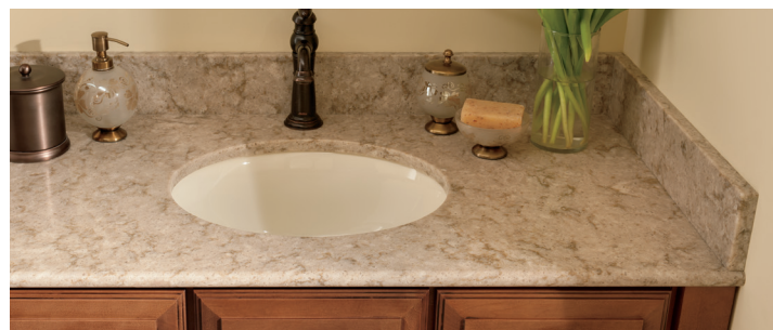
Shown with Back and Right Splashes

Your vanity will come with a standard, non-attached backsplash. For added style, side splashes are also available as an upgrade.