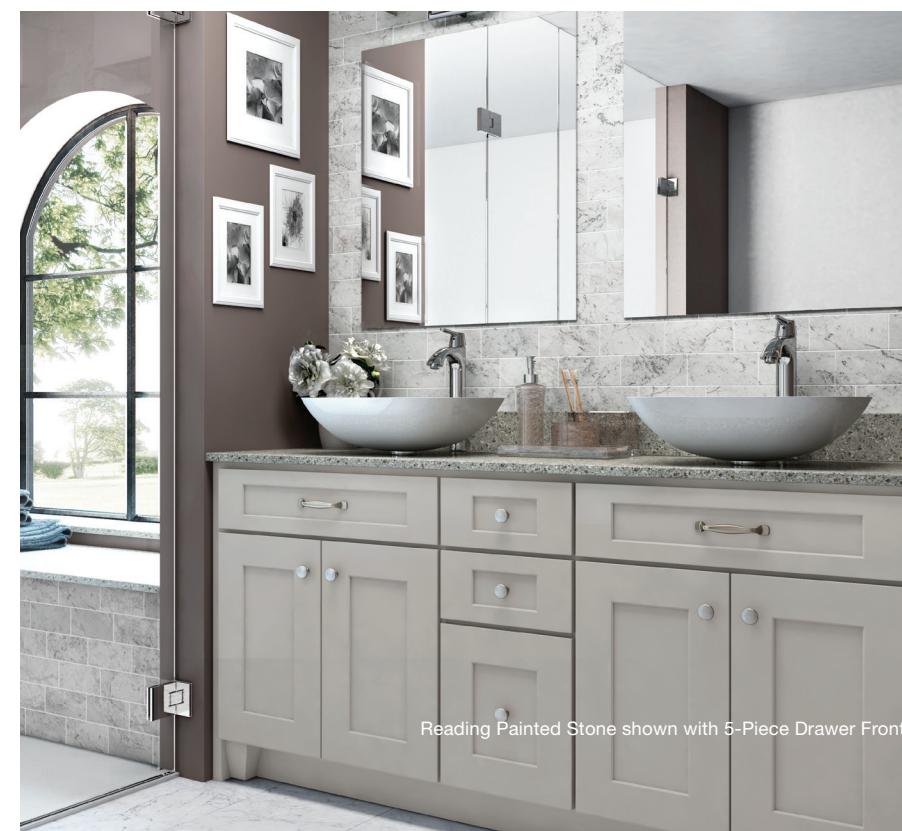
Reading Painted Stone shown with 5-Piece Drawer Front