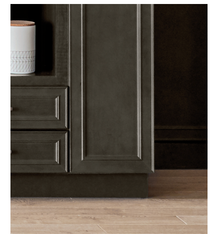
Recessed Toe Kick