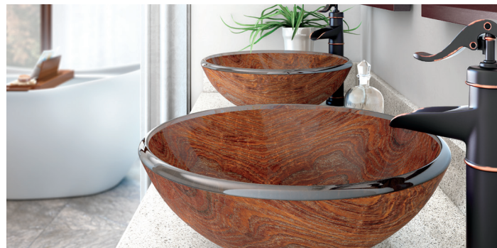
Vessel Sink Drill Option with Faucets in Both Outer Placement*