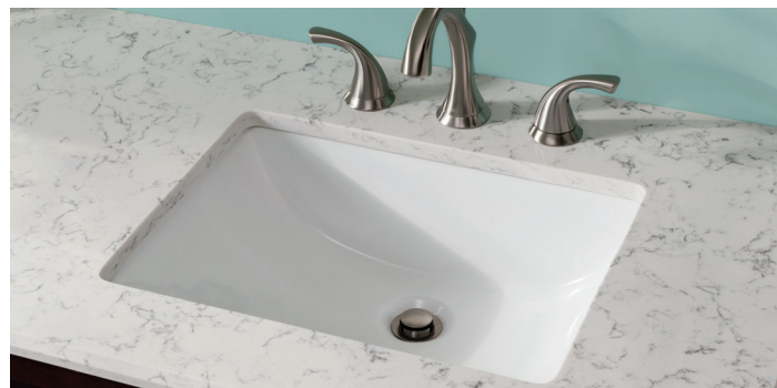
Rectangular White Sink with 8" Faucet