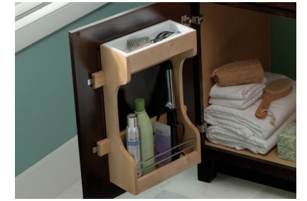
Sink Base Door Storage Unit