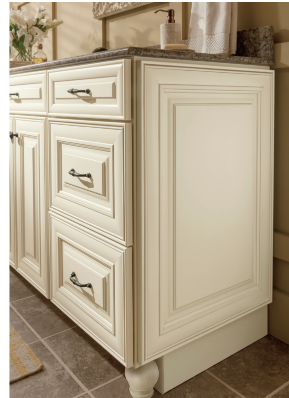
Furniture Ends with Decorator Doors

Dress up your vanity with decorative details that you'll enjoy for years to come.