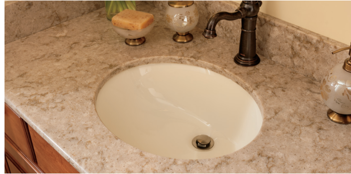
Oval Bisque Sink with Single Faucet

A single oval sink is available as a standard with your vanity. Upgrades include rectangular or double sinks for an added charge. Available sink colors are shown, with options for one-hole or three-hole faucets, as well as drilling options for vessel sinks.