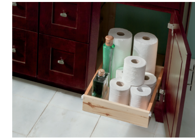
Roll Out Tray

Bring extra convenience and functionality to your vanity with storage options like the ones below.